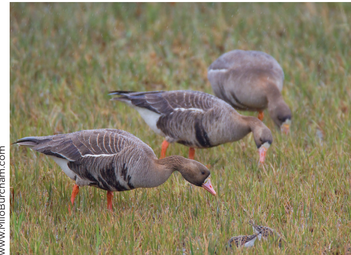
GREATER WHITE-FRONTED GOOSE